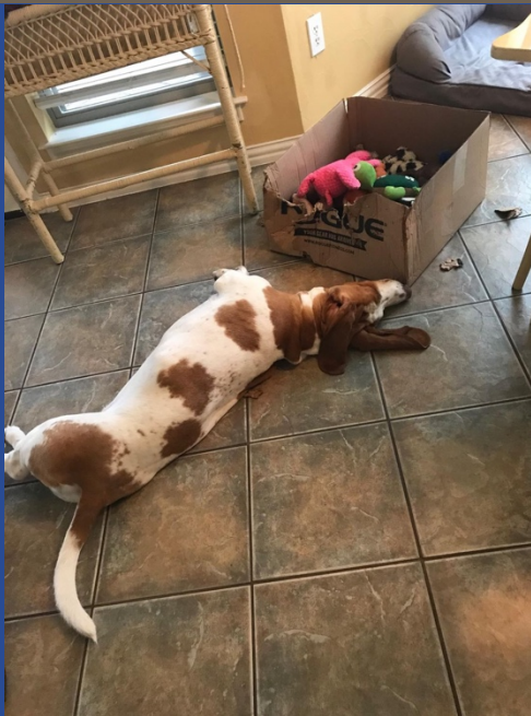
Foster Scotty was exhausted from chewing his toy box.