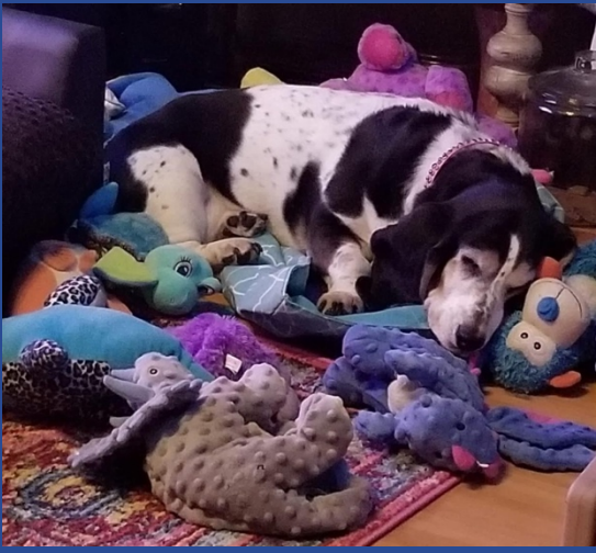
Jules finds a comfy spot for a nap on top of her toy box.