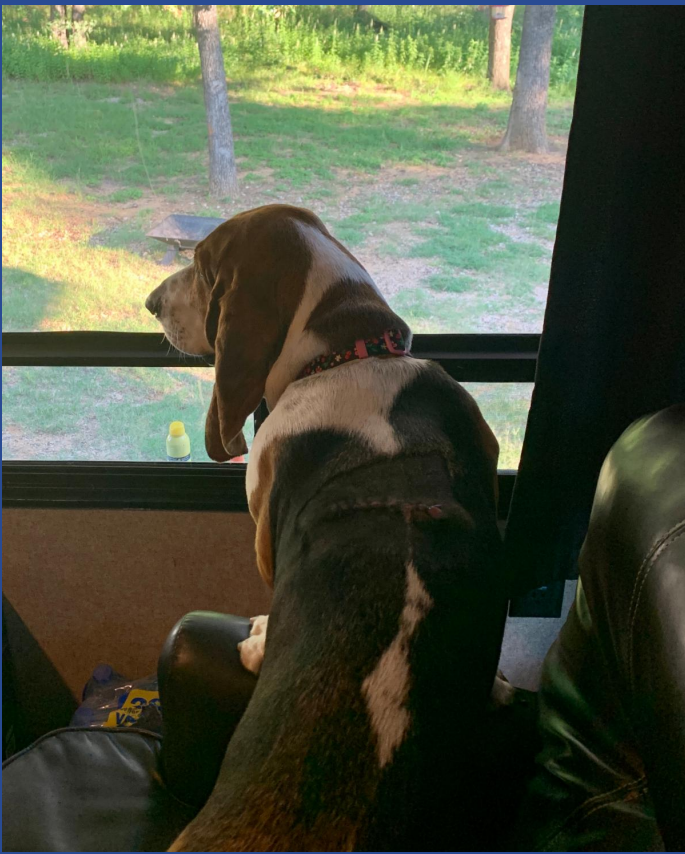
Stella, NTBHR basset #1781, has joined her forever family. She loves camping, snuggling, and exploring her yard.