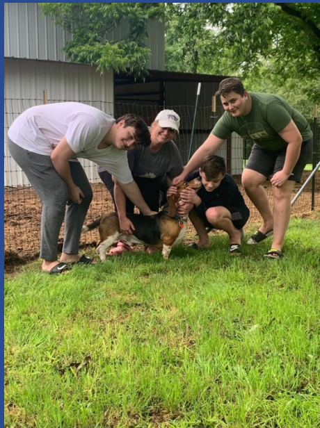
Buster joined his forever family in May, 2021! Happy tails, Buster!